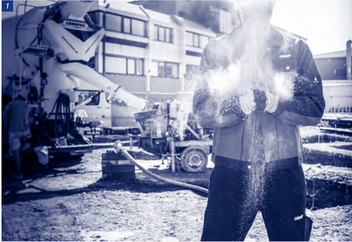
1 2 Expansion of our corporate headquarters

The new building, costing about 3.8 million euros, will become the new corporate headquarters of AutomationX GmbH.