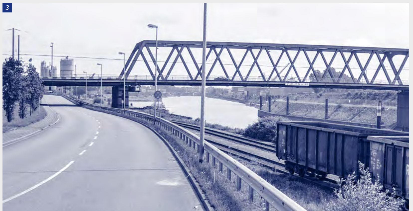
3 4 Kresta Office at Duisburg Harbor

The Duisburg harbor is the largest domestic harbor in Europe and offers the best traffic connection as well as enhanced flexibility for delivering to the customer.