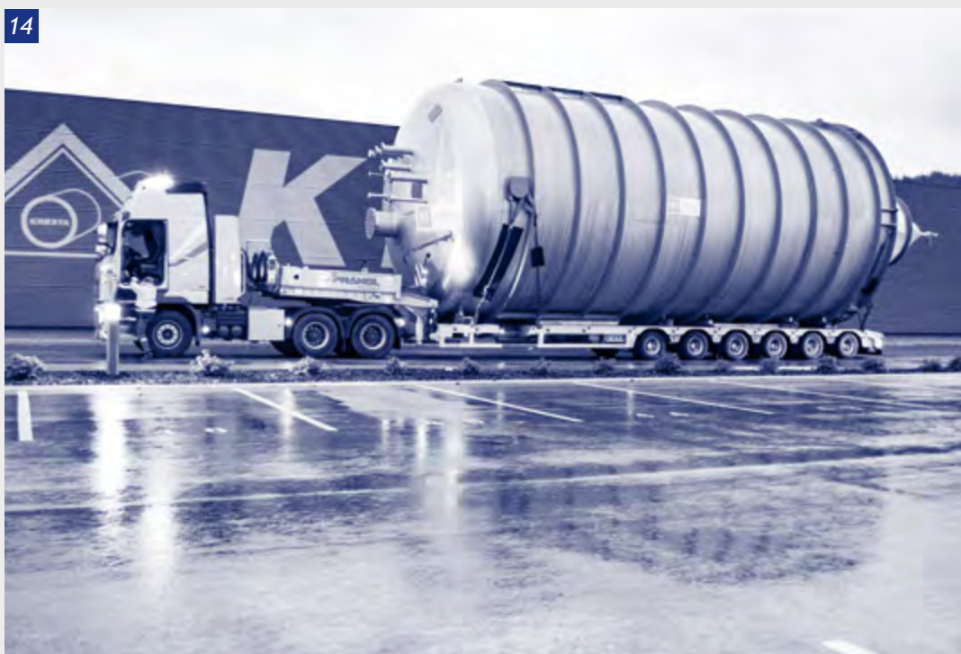
13 14 15 A massive challenge for heavy-duty trucks

This production stoppage was planned out in detail and was a great challenge to the Kresta Team. The reason for that is that it requires precise planning and preparation to be able to adhere to the schedule for the installation and replacement of the pipelines.